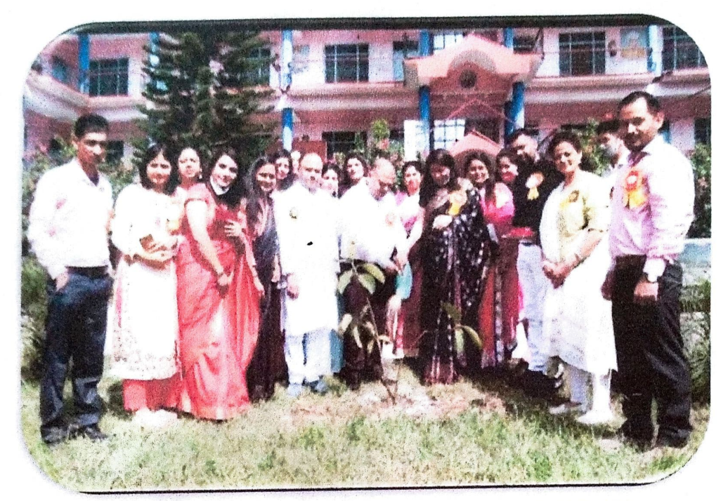
PLANTATION DRIVE ON TEACHER'S DAY