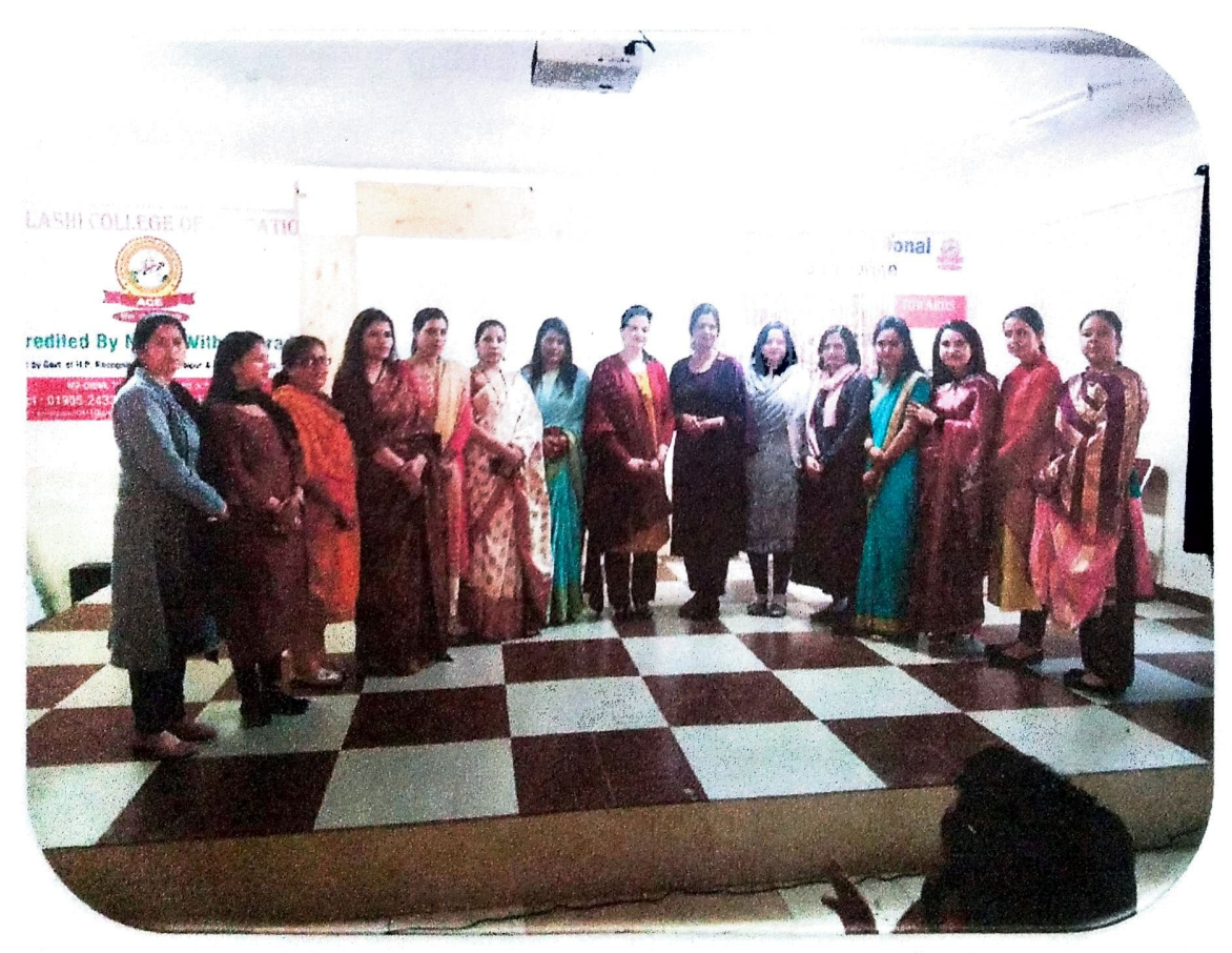
CELEBRATIONS OF INTERNATIONAL WOMEN'S DAY

MONTHLY CLEANLINESS CAMPAIGN (4TH SATURDAY OF EVERY MONTH)