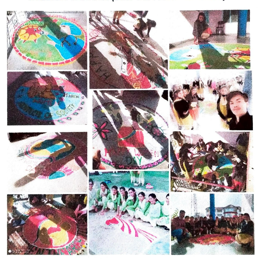
RANGOLI COMPETETION ON WOMEN'S DAY

Principal Abhilashi College of Education Ner Chowk, Distl. Mandi (H.P.)