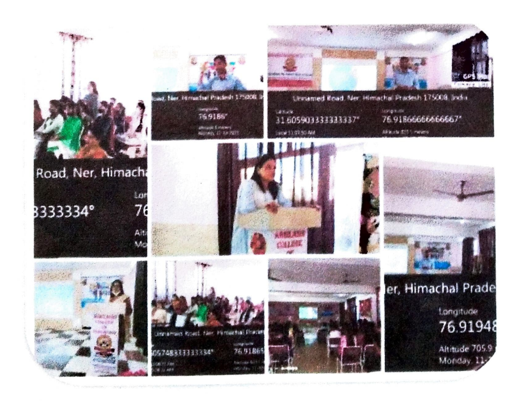
SEMINAR ON MENTAL HEALTH DAY