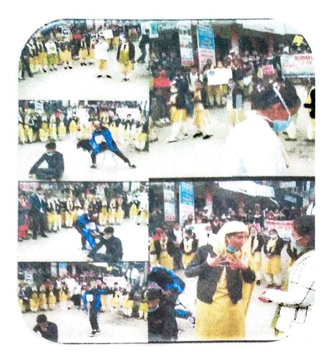
NUKKAD NATAK BY STUDENTS