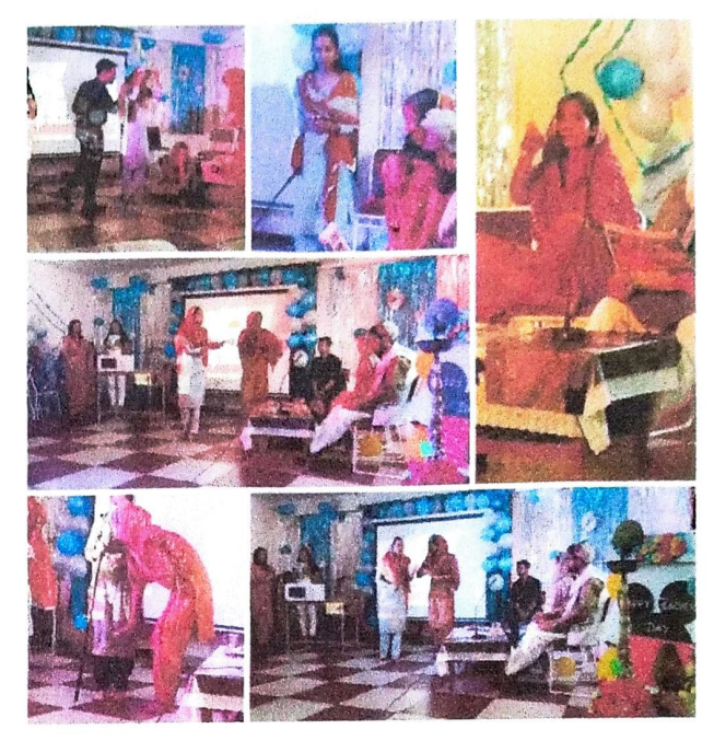
SKIT ON GENDER EQUITY